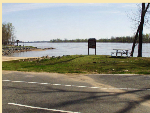
Red River at Arthur Ray Teague Boat Ramp.

Groundwater wells are the sole source of water for most of these systems except for the Town of Benton, East 80 Utilities