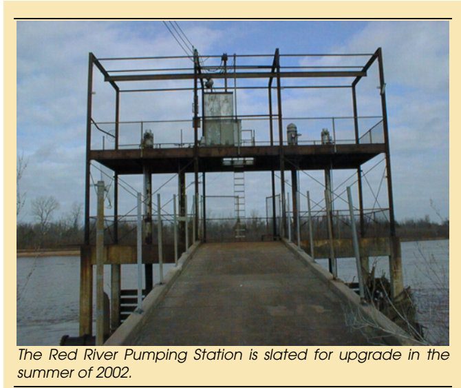
The Red River Pumping Station is slated for upgrade in the summer of 2002.

both existing pumping stations to assure an adequate supply to the treatment plant from either location.