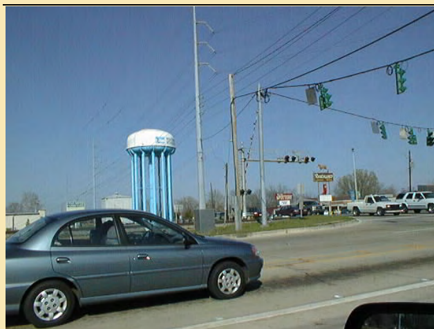
Airline Drive water tank.

The Bossier City Red River Wastewater Treatment Plant, which is approximately 25 years old, has a total treatment capacity