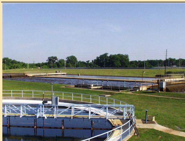
Clarifier and oxidation ditch at Red River Wastewater Treatment Plant.

The Bossier City Northeast Plant has a treatment capacity of 6 MGD and serves the northern and western sections. It