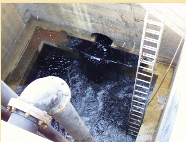
Influent wetwell at the NEWWTP.

A recent odor control modifications and improvements project at both Bossier City wastewater plants will be completed in the Spring of 2002. This project will upgrade the treatment plants to include covers and chemical scrubber