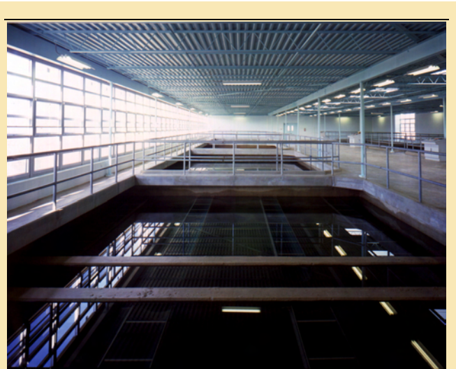
Filter gallery at Water Treatment Plant.

The Bossier City Water Treatment Plant (WTP) underwent a major expansion and improvement project completed in the summer of 2000. Plant treatment capacity was increased from 16 MGD to 25 MGD. Raw water total