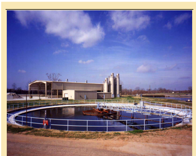
Expansion of Bossier City's wastewater treatment facilities to serve outlying areas is not practical.

and additional treatment loading that would be involved. The concept of sewer district establishment for rural areas of the parish, however, is an option that parish government may want to consider. Funding mechanisms are available through the Environmental Protection Agency Office of Water.