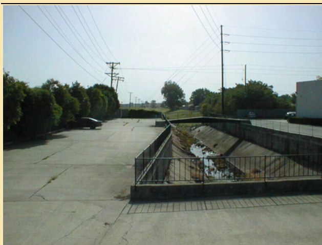
Replacement of failing ditch pavement should be a priority.

development of drainage hydrologic and hydraulic design criteria manuals, best management practices manuals with standard details, and standardization of City and Parish requirements.