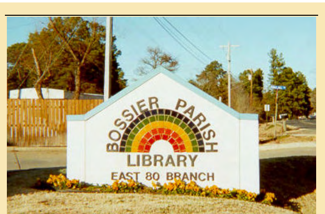
The East 80 Branch of the Bossier Parish Library System is slated for significant expansion in 2006.

income according to data available through the State Library of Louisiana.