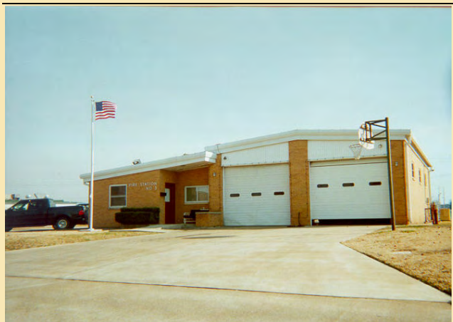
Bossier City’s Fire Station No. 9 is located at 2621 Brownlee Road in north Bossier. It is the City’s newest station.

Objective B: Pursue supplemental funding through grants and other means to reinforce agency missions.