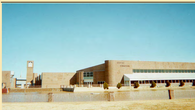
The implementation of plans to develop the Municipal Complex was ambitious, but effectively accomplished, with good planning and anticipation of community needs.

City/Parish or the other entity is able to pay for subsequent operation and maintenance costs.