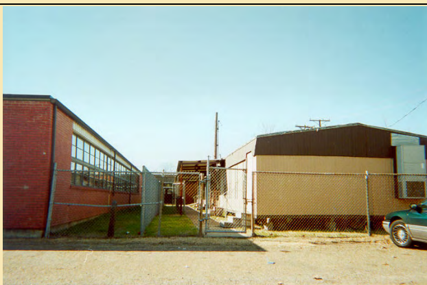
Older school facilities are sometimes ill-equipped to address shifting populations, and portable buildings help fill the gap.

The provision of adequate public facilities for education is of incalculable value to Bossier. Primary and secondary schools that are neighborhood oriented are key contributors to the creation and long-term sustainability of the “community.” Community involvement in the schools enables the children and educators to thrive. In the MPC