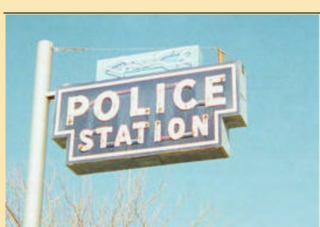
Law enforcement activities in the MPC Planning Area are addressed by multiple agencies, with each committed to teamwork and preserving and enhancing Bossier’s quality of life.

Action 11.1.5: Continue regular training of police personnel to meet all applicable state and national standards and certifications.